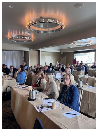
Saturday CLE - Members