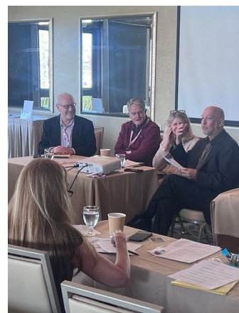
Saturday CLE - CalArb Group