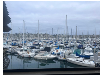
San Diego Marina View