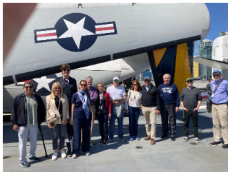
U.S.S. Midway Tour